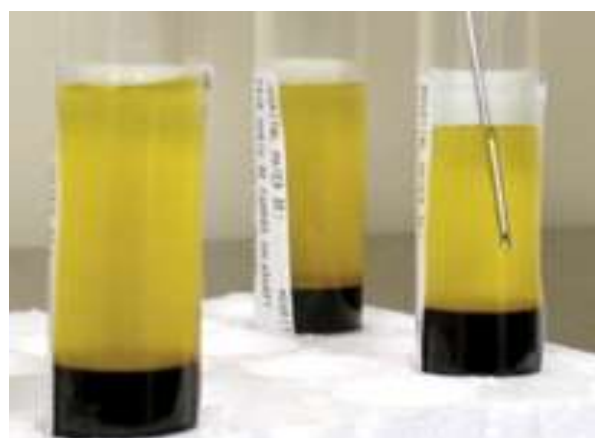
Fig. 1: Plasma being removed

Preparation of Platelet-Rich Plasma: Many different procedures for PRP preparation are mentioned in different papers. These all procedures produce different compositions that may account for result variability. Most often the two step centrifugation is used to separate blood components, and to concentrate platelets (and optionally leukocytes) in the final PRP product. Alternatively, one centrifugation step generates a PRP product with a moderate/low concentration of platelets depending on centrifugal force and time (Fig. 1). Overall, it was found that in "PRP+MSC" research there is a slightly higher use of PRPs with high or super high concentrations of platelets (Fig. 2). (19)