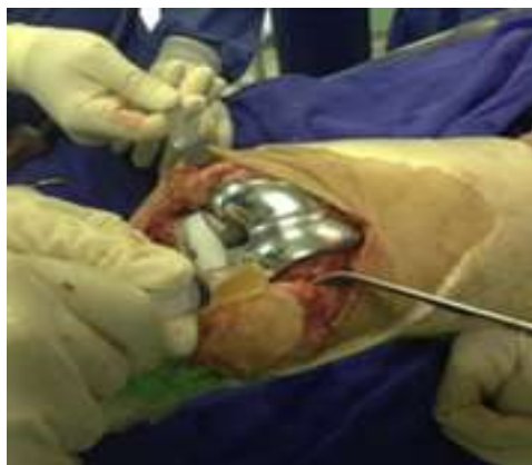
Fig. 3: Application of PRP to joint cavity

PRP injection protocol and its application to the joint cavity is mentioned in Table 2 and Fig. 3.