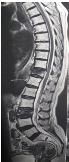
Fig. 1: MRI spine showing collapsed vertebra D11 and L3

After 3 days she complained of back pain and unable to weight bear. Examination showed paraparesis, with power 2/5 in legs, sensation reduced below L1 and normal bladder and bowel functions. She urgently had MRI of spine (Figure 1) that showed collapsed osteoporotic vertebra and impingement of the cord resulting in leg weakness. She was screened for Covid 19 as per institutional protocol and was found to have an RTPCR test negative. Her CT chest Showed fibrotic strands and no ground glass changes or nodes.