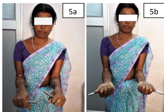
Fig. 5a, b: Showing- at 3 years follow up, active supination and pronation of wrist