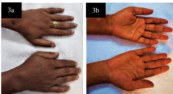
Fig. 3a, b: Showing- healed sinuses on dorsal and ventral surface of wrist joint