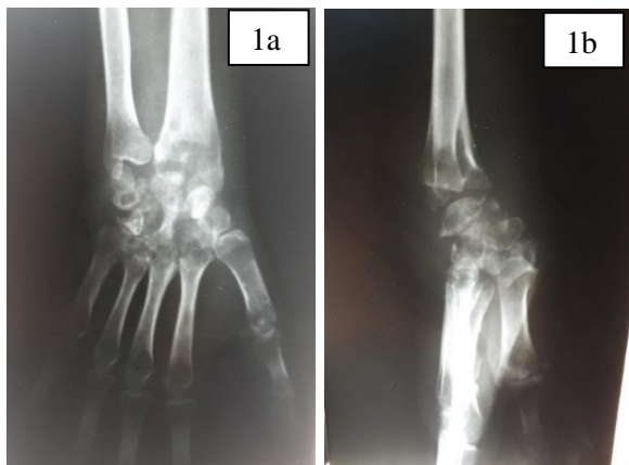
Fig. 1a, b: X-ray showing active tubercular arthritis of wrist

At 3 years of follow up, she is still continuing DMARDs and there is no recurrence of symptoms of either TB wrist or RA. Her peripheral joints including left wrist are painless, have no evidence of active inflammation, (Fig. 3a, 3b) have near normal range of motion (pronation of left forearm restricted in terminal range) and are functionally useful (Fig. 5a, 5b, 6a, 6b) despite the presence of gross bony destructions on x-ray of the left wrist and hand. (Fig. 4a, 4b)