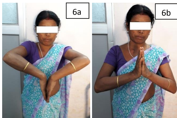
Fig. 6a, b: Showing- at 3 years follow up, active dorsiflexion and palmar flexion of wrist