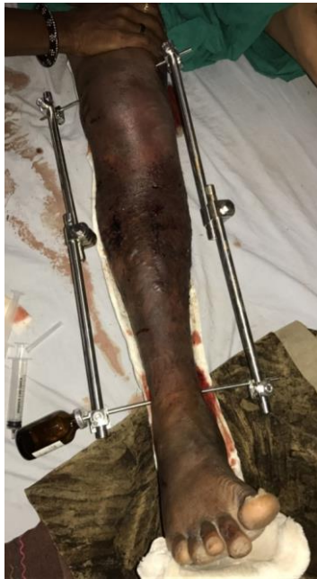
Fig. 2: Showing distraction fixator in patients with severe soft tissue swelling and blisters

Once the skin conditions become favourable, patients are called up for definitive surgery.