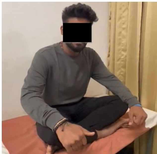
Figure 4: Crossed leg sitting at 4 months post-op

with contraction of the Rectus femoris tendon and tightness in it indicating successful muscle healing and restoration. Also, upon static contraction of the Quadriceps, contraction of the rectus belly and superior movement of the Patella could be seen. The palpable gap was not felt anymore and the tautness of the Rectus femoris tendon was noted. Consequently, the patient was given clearance to resume training and participation in competitive sports, including Kabaddi, and demonstrated a return to his pre-injury level of performance without any limitations or restrictions.