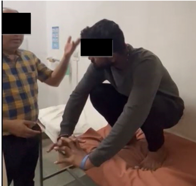
Figure 5: Squatting at 4 months post-op