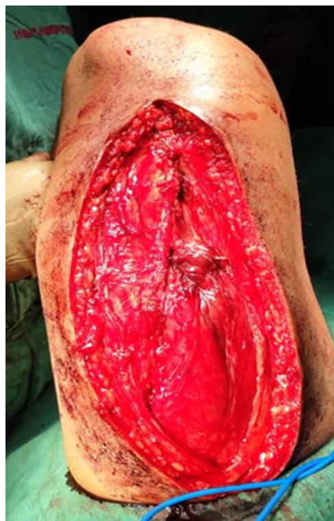
Figure 2: Intraop picture showing repair of rectus femoris sutured with semitendinosus graft using Biofiber

To fortify the repair, the muscular tunnel was made in a rectangular fashion in the Distal Rectus femoris belly. The tendon was secured to muscle in the tunnel. Semitendinosus graft was placed from the tip of the Rectus belly to the Distal Quadriceps tendon. The rip-stop technique was used with firewire to prevent cut-through or proximal migration of graft in muscle so that muscle won't cut through or lose its desired position. A rigorous assessment of the repair's integrity throughout the knee's complete range of motion in flexion and extension was conducted before wound closure.