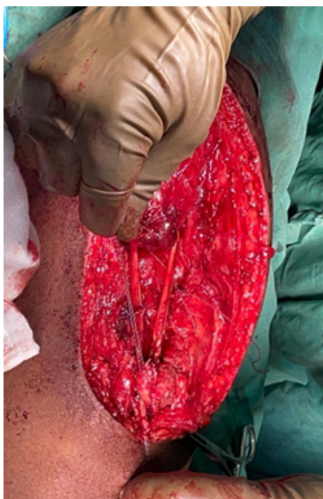
Figure 3: Rip-stop technique with fiber wire to prevent proximal migration of graft into muscle