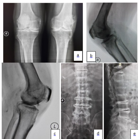
Fig. 2: Preoperative, 2a: anteroposterior radiograph of knees, 2b: lateral radiograph of right knee, 2c: lateral radiograph of left knee, 2d: anteroposterior radiograph of lumbosacral spine, 2e: lateral radiograph of lumbosacral spine.

Clinical manifestations of ochronosis includes dark brownish pigmentation of connective tissue such as sclera, ear, laryngeal, tracheal, and meniscus cartilage, darkening of urine after long-term exposure to air, major joint arthropathy, spondyloarthropathy, cardiac valve disease, nephro-calcinosis and renal dysfunction. 2,8 Knee and hip are the frequently affected joint. Radiographic changes in the large peripheral joints specially knee joints, are generally observed ten years after spinal changes. Like in patients with primary osteoarthritis, radiographic changes include joint space narrowing, small osteophytes and subchondral sclerosis. 4