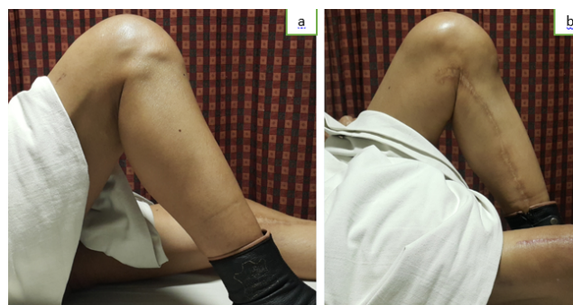
Fig. 4: Postoperative clinical photograph at 2 year follow up, 4a: right knee flexion, 4b: left knee flexion.